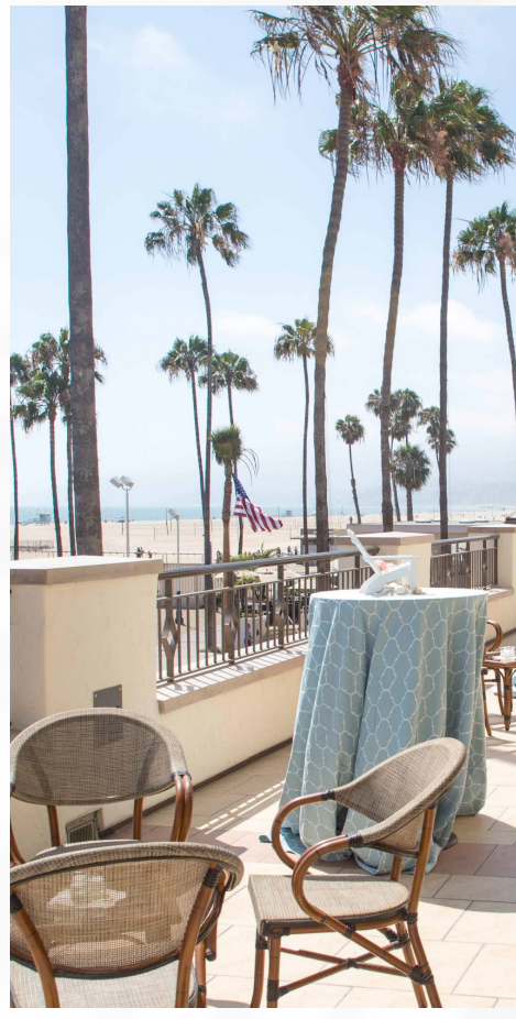
ANACAPA ROOM & TERRACE