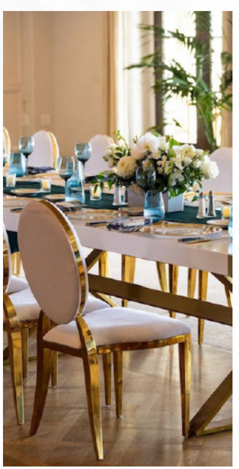
CATALINA 150 Seated 250 Standing Reception